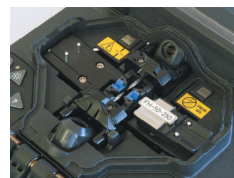
Top view of FSM-17S-FH

Specifications and descriptions are subject to change without prior notice.