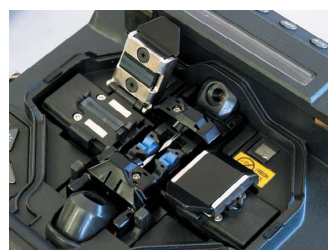
Top view of FSM-17S