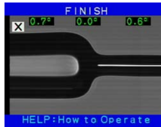
400-125 \mu m splicing