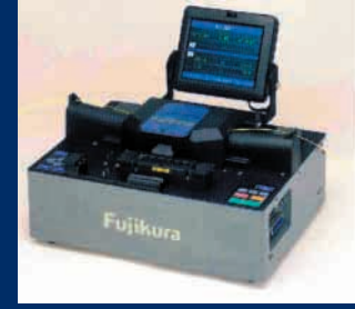
Fujikura Fusion Splicer